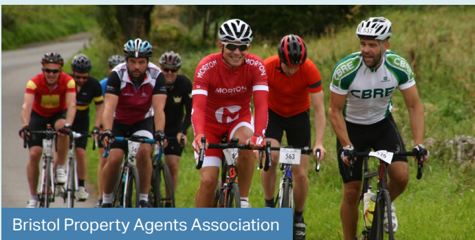
Bristol Property Agents Association