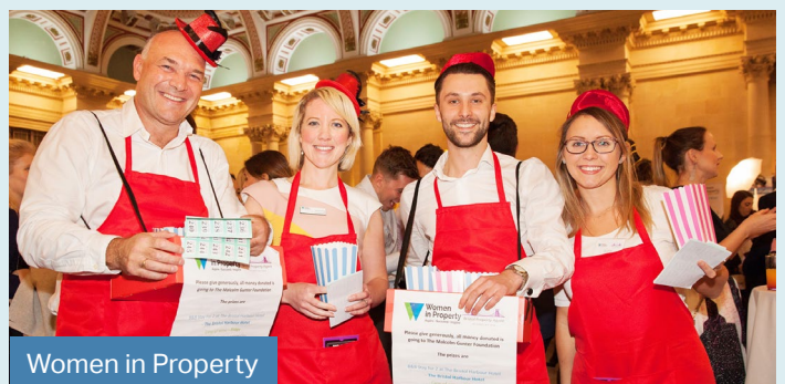
Women in Property